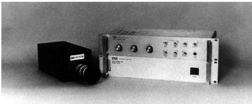
CVI Data Camera, 1970. Collection of ETC, Ltd. & The State University of New York, Binghamton.