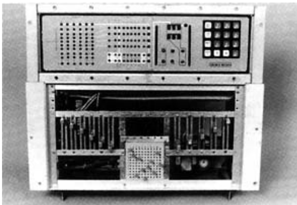
Multikeyer, 1973. Collection of the Vasulkas.

A pre-scaler counter times the stepping speed of the sequence from an external sync source, or a front panel manual pushbutton switch. The counter speed from 1-63 counts is loaded into a register from the front panel knob. The output of the pre-scaler drives a 15 step sequence counter. The output of the sequence counter drives a set of 15 vertically oriented lamps indicating the step position in the sequence. Adjacent to the lamps are a set of 15 switches, their position selecting either the "X or "B" video source. The sequence length can be reduced to less than 15 steps if desired, by a length register loaded with the control knob. Fast switching of frame rate sequences are easily programmed by flickng the toggle switches and viewing the output.