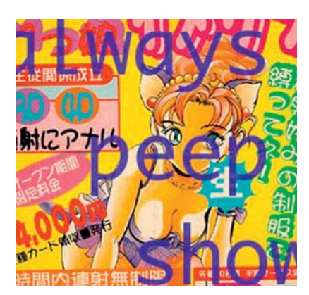
Figure 6. Forever Peep, from dollspace, da Rimini, 1997.

a deeply inscribed xx clawing (asleep) Venus in Furs Contract #2768 ghost of River Phoenix GashGirl's Puppet costume chest