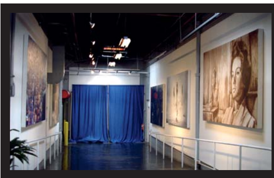
Figure 3b. Snake Charmer veiled by Obama's people.

Might Freud have included some artefact of these pix in his ethnographic treasure cabinet? The accidental pudenda, tantalizingly cropped and rerendered?