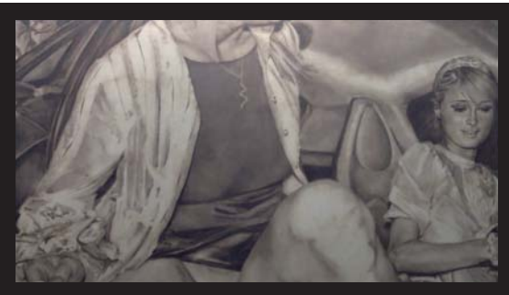
Figure 3a. Snake Charmer , Jamie D. Boling, oil on canvas, 72" x 120".

Trailer Snatch Britney's pussy ain't that little, eh? Britney has no panties Britney Spears Flashing