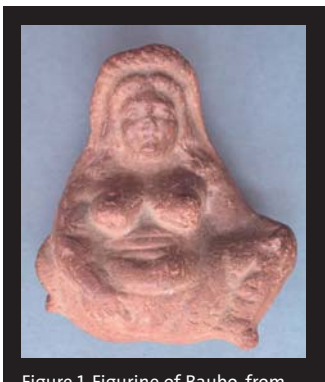
Figure 1. Figurine of Baubo, from the collection of Sigmund Freud

Back story: Demeter (Mother Earth, Distribution Mother) sets out in search of Persephone (Kore, Daughter), who has been abducted by Hades (the Unseen One). In Eleusis at the court of King Celeus, the inconsolable goddess encounters the nursemaid Baubo. Concerned about Demeter's refusal to eat, to drink, Baubo lifts her gown, exposing her "secret parts" to all. Her transgressive gesture, a lateral approach to the problem of mourning, drew deep laughter from Demeter who is "delighted by the spectacle." She continues her quest.