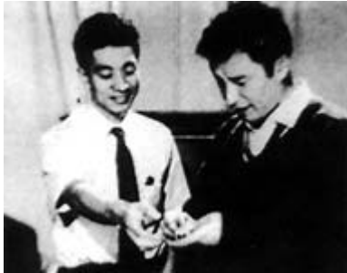
Shuya Abe and Nam June Paik.