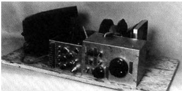
Paik/Abe Scan Modulator. Collection of ETC.

WITH THE PASSAGE of time, the understanding of Paik does not get easier. In our own time slit, his presence assumes a lonely and therefore much larger proportion. His work in the sixties, luckily, is the most relevant for our show. As a practitioner looking back on that period, I realize (maybe for the first time) the scope of the homework he has done. Once you get over his early Fluxus furniture pieces, there is a naked man with his metaphysical struggle. There is a testimony and revelation of many principles and the materials to come. Even after he could afford all the help he could buy, a substantial body of work, experiments, manifestos and personal interventions remains for all of us to see!