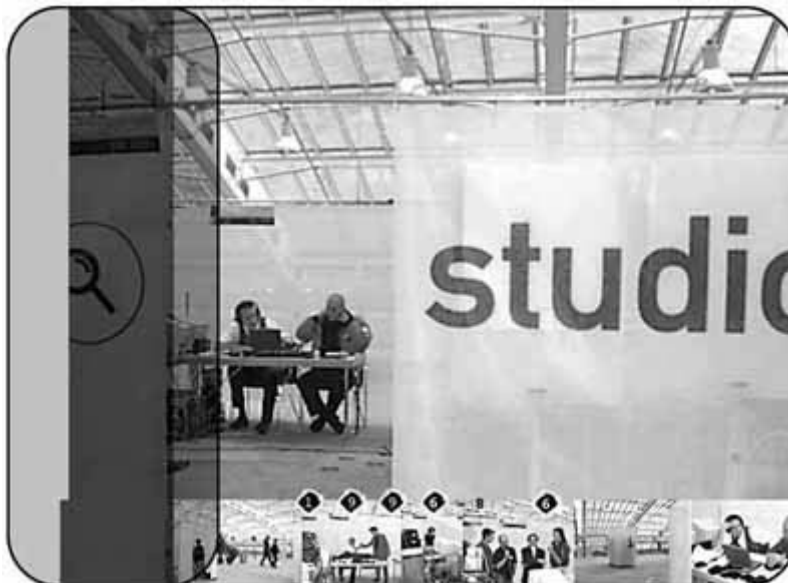
TNC's Webstudio at Ars Electronica 96